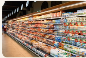
37 shopping facilities