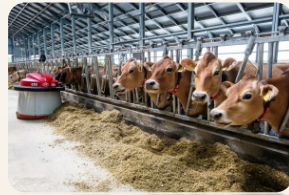
23 new dairy farms