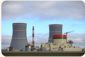
Second power unit of a nuclear power plant