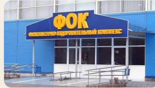
2 fitness centers