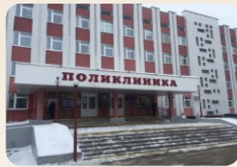
3 outpatient and polyclinic institutions