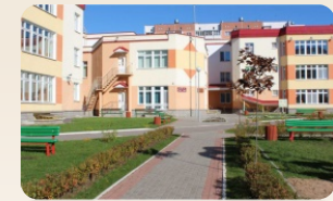
15 pre-school education institutions

When using the information, the reference to National Statistical Committee of the Republic of Belarus is obligatory.