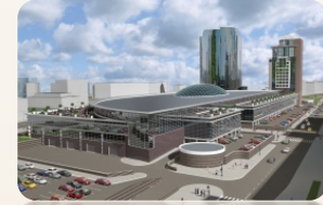
8 multifunctional complexes