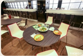
4 catering facilities