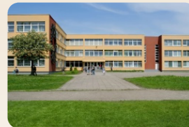
2 general education institutions